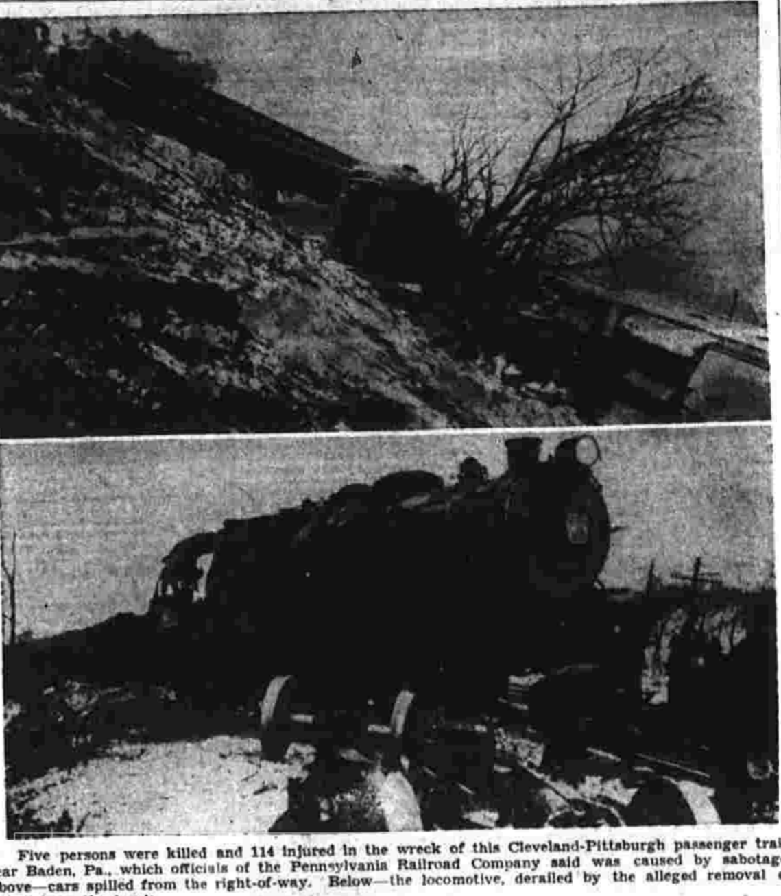
Five persons were killed and 114 injured in the wreck of this Cleveland-Pittsburgh passenger train near Baden, Pa., which officials of the Pennsylvania Railroad Company said was caused by sabotage. Above—cars spilled from the right-of-way. Below—the locomotive, derailed by the alleged removal of spikes from the track.